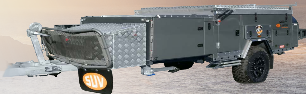
2x Spare Wheels

Optional extras are not included in the tare weights