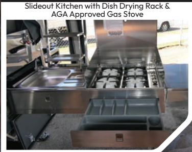
Slideout Kitchen with Dish Drying Rack & AGA Approved Gas Stove